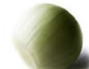
Spanish Onion - Peeled