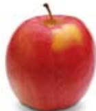
Pink Lady Apples