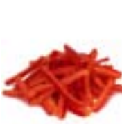
Julienne Peppers (Red or green)