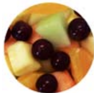
Fruit Salad (Dry pack or in juice), Fruit Bowl