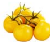
Yellow Cluster Tomatoes