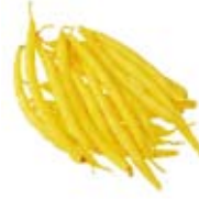
Wax Yellow Beans