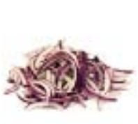
Red Sliced Onions