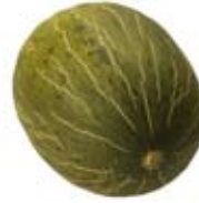
Santa Claus Melon