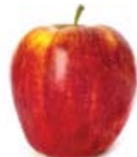
Royal Gala Apples