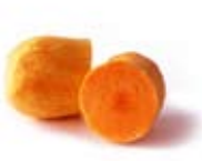
Peeled Butternut Squash