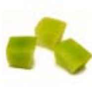
Honeydew Chunks (Dry-Pack)