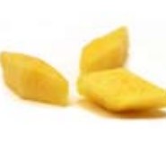
Diamond cut Pineapple