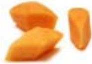
Diamond Cut Cantaloupe