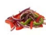
Stir-Fry - Fajita