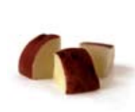
Diced Red Potatoes