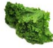
Green Leaf Lettuce