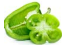
Green Bell Pepper