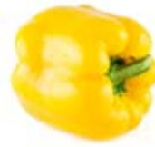
Yellow Bell Pepper