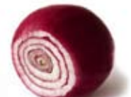
Red Onion - Peeled