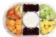
Fruit Tray with Yogurt Dip