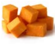
Diced Butternut Squash