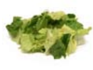
Salad Blend 80-20