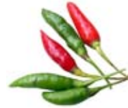
Birds Eye Chillis