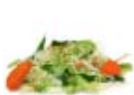
Lo Mein Oriental