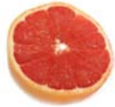
Pink & Red Grapefruit