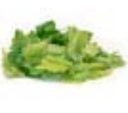
Chopped Romaine Hearts