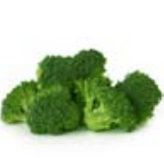
Broccoli Florettes or Rosettes