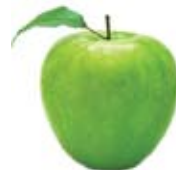
Granny Smith Apples