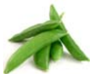
Sugar Snap Peas