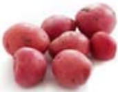
Red Creamer Potatoes