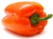
Orange Bell Peppers