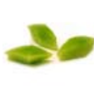
Diamond Cut Honeydew