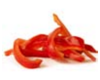
Sliced Peppers (Red, green, yellow)