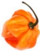
Scotch Bonnet Peppers

Do not stack heavy objects on top of bell peppers. Bell peppers can easily be crushed or bruised.