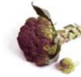
Broccoli (assorted colours)