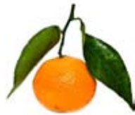
Clementines & Tangerines