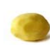
Yukon Gold Potatoes