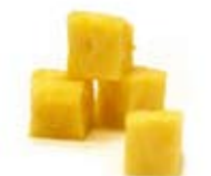
Pineapple Chunks (Dry Pack or Bowl)