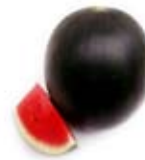
Sugar Baby Watermelon