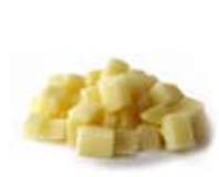
Diced Yukon Potatoes