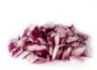
Red Onions Diced