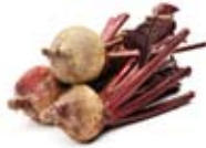
Red Baby Beets