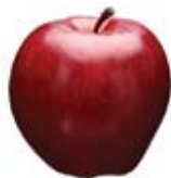
Red Delicious Apples