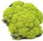
Cauliflower (assorted colours)