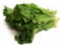
Green Leaf Fillet