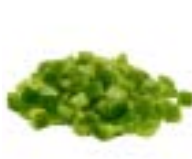
Diced Peppers (Red or green)