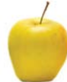
Golden Delicious Apples